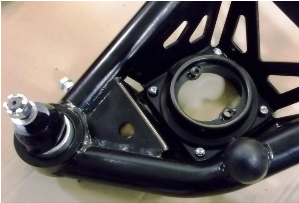
Figure 1 (P/N 7720-168)